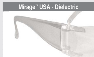
Mirage™ USA - Dielectric